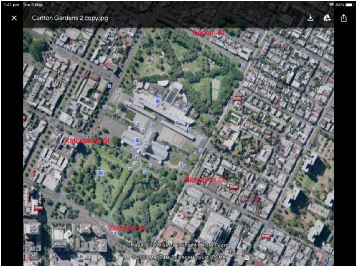
Carlton Gardens 2009