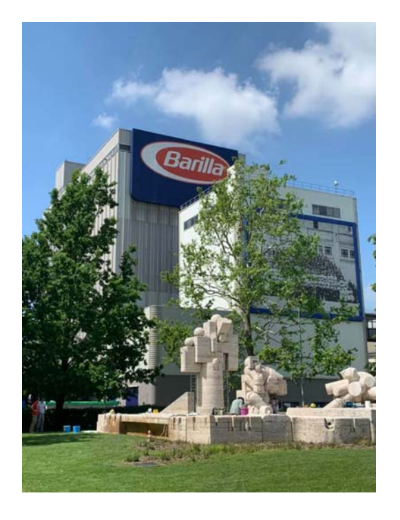
Above: the largest pasta factory in the world