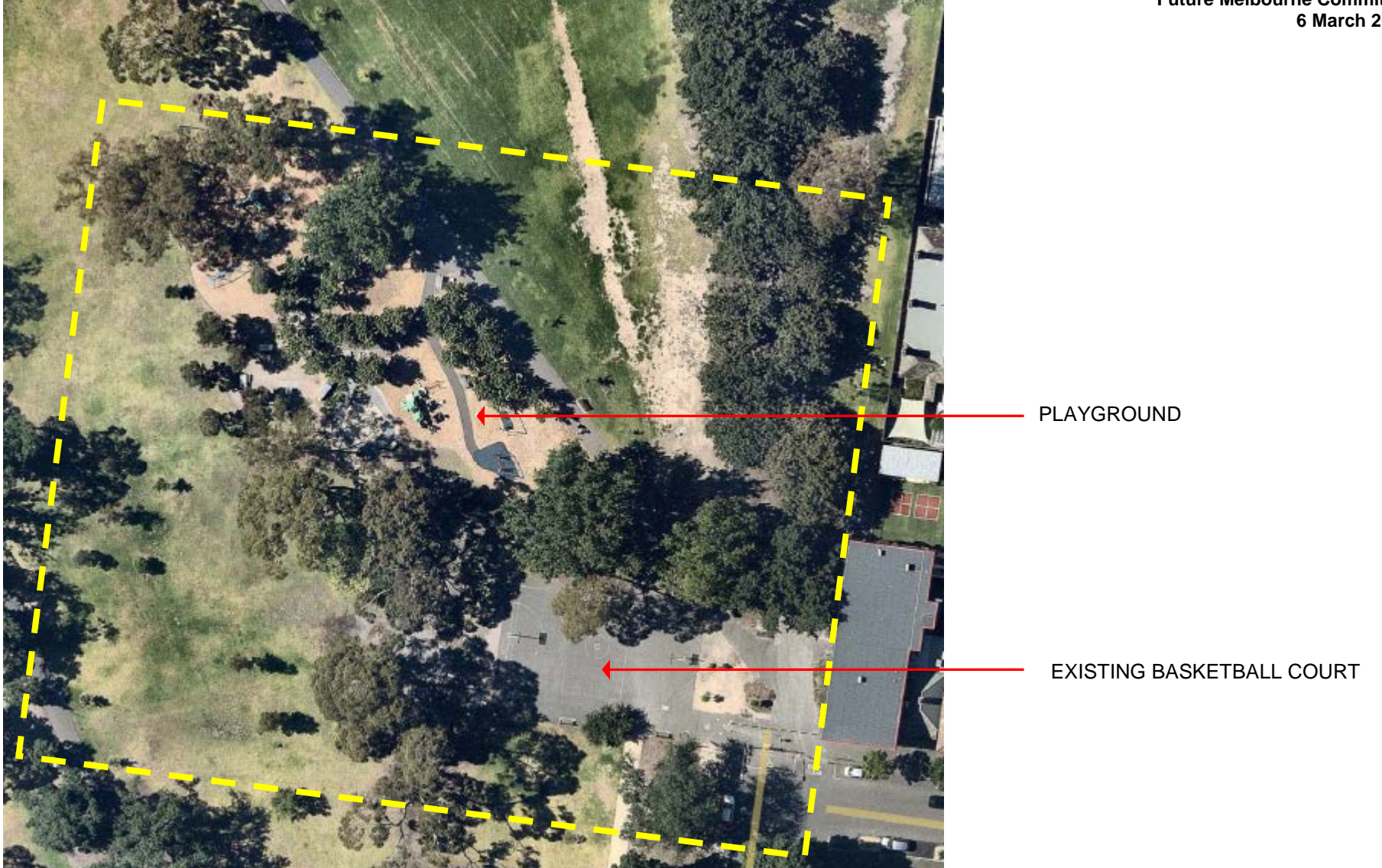
Project area – Fawkner Park, existing conditions

Attachment 2 Agenda item 6.5 Future Melbourne Committee 6 March 2018