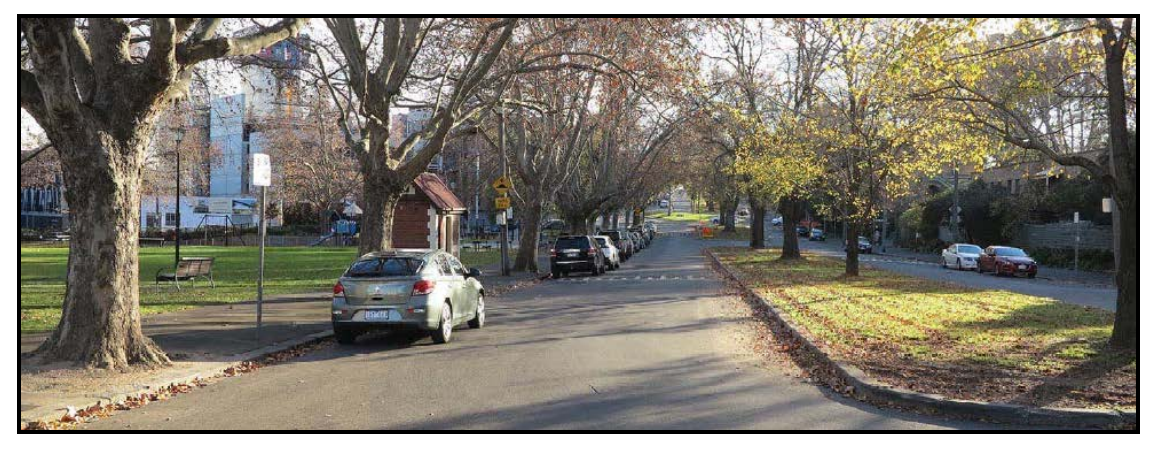
Existing view looking north on Drybugh Street.