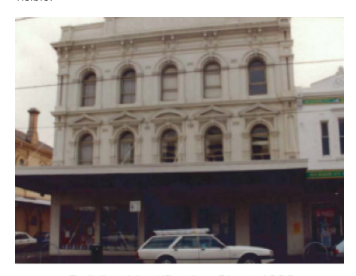
Building Identification Sheet 1985

The following is the building when graded C in the 1985 Urban Conservation Study. No signage is visible.