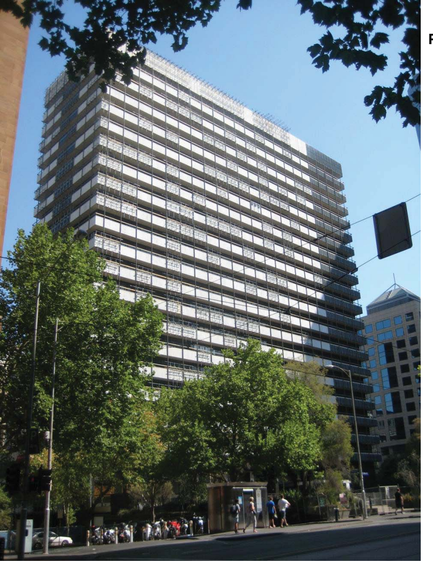
Page 4 of 19