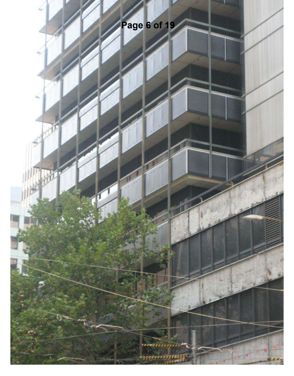
New cladding to William Street facade