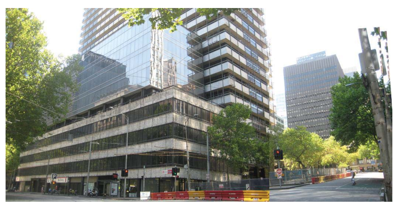
Market Street (partially closed) & Flinders Lane