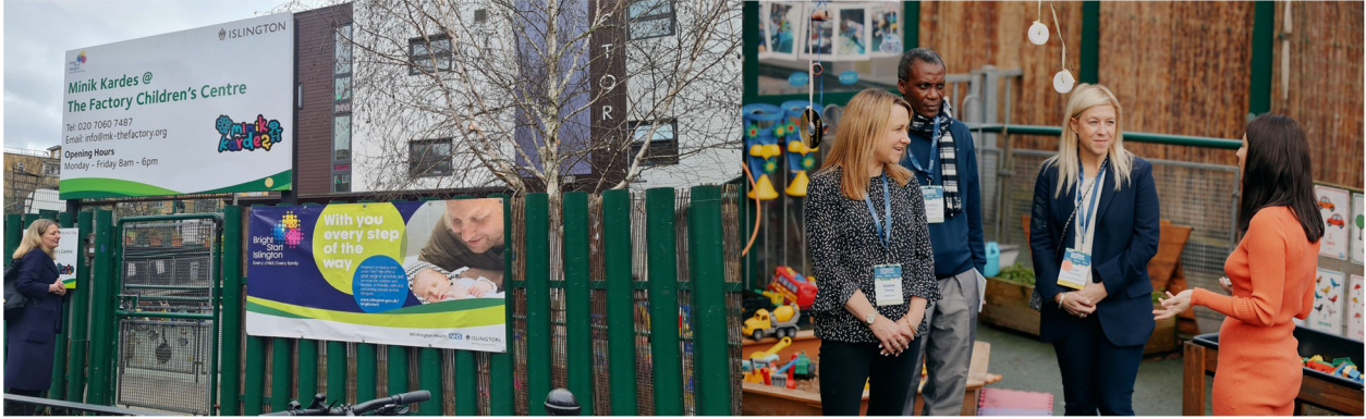
Site visit to The Factory Children's Centre

Since 2020, early childhood staff have received training in responding to childhood trauma so they can work with parents to support children's emotional well-being. Further programs support staff with their own mental health and well-being.