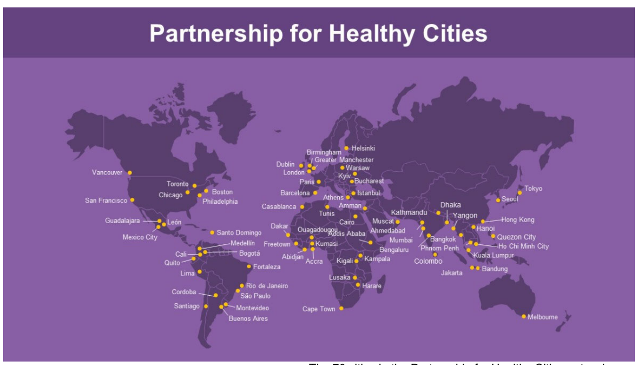
The 70 cities in the Partnership for Healthy Cities network

Sustainable Development Goal (SDG) No. 3 on health and well-being aims to reduce by one-third premature mortality from non-communicable diseases by 2030 through prevention and treatment and by promoting mental health and well-being: www.un.org/sustainabledevelopment/health/