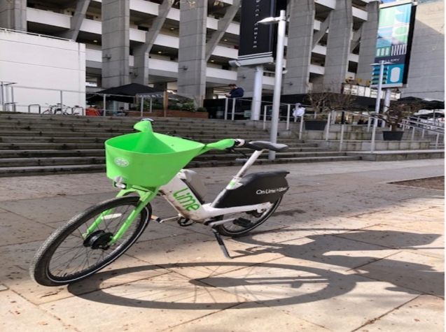
Bicycle hire and e-scooters on London streets