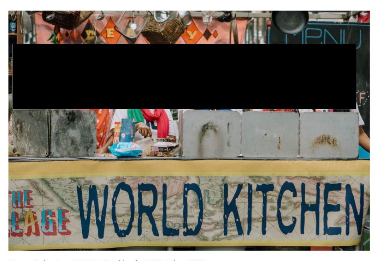
Cirque Culinaire at District Docklands, 30 October 2022

This investment of $50 000 is money well spent as it will allow continuity of staffing at DNH, and will allow DNH to work closely with City of Melbourne to ensure Council's short-term priorities for the Docklands community are delivered.