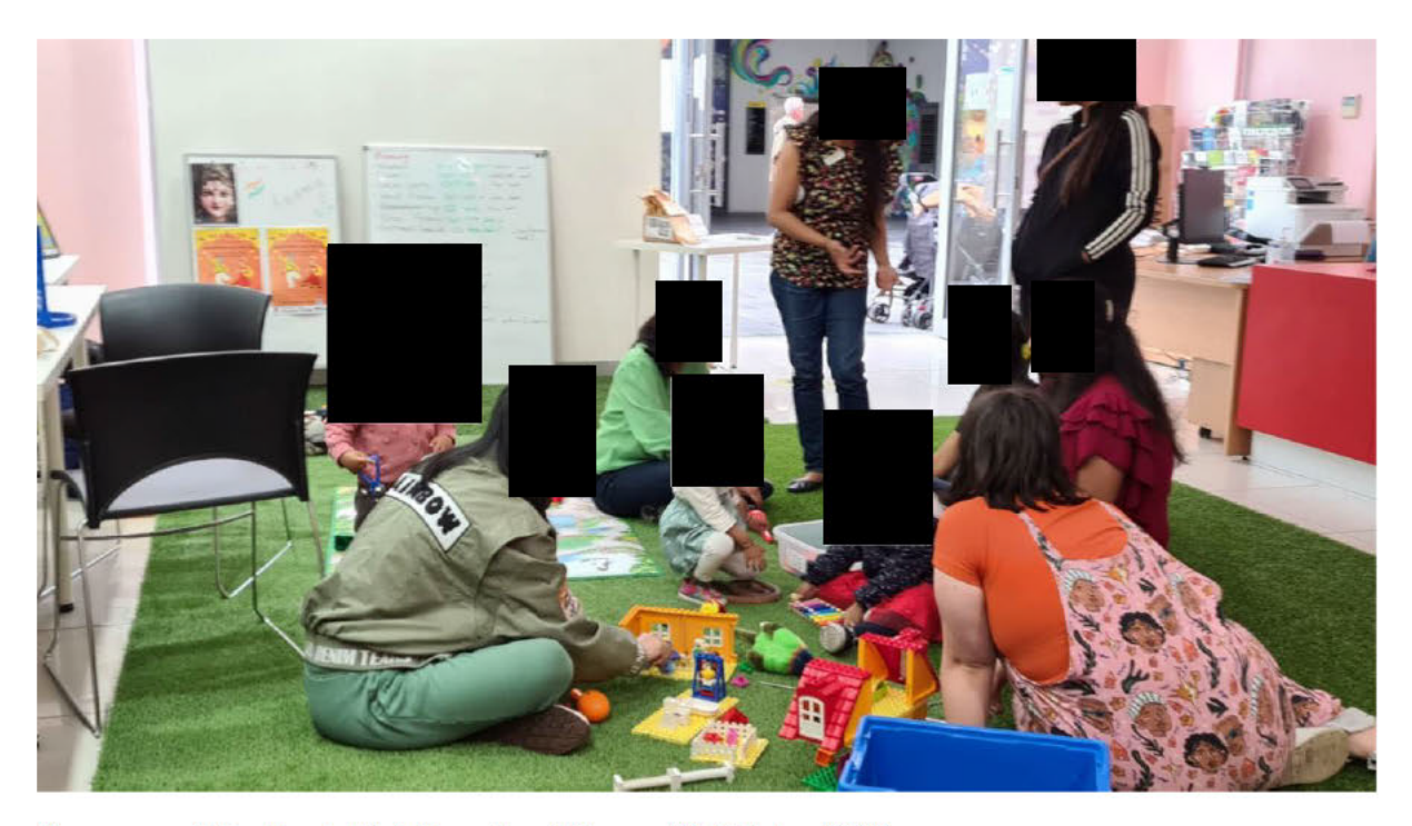
Playgroup at Docklands Neighbourhood House, 26 October 2022