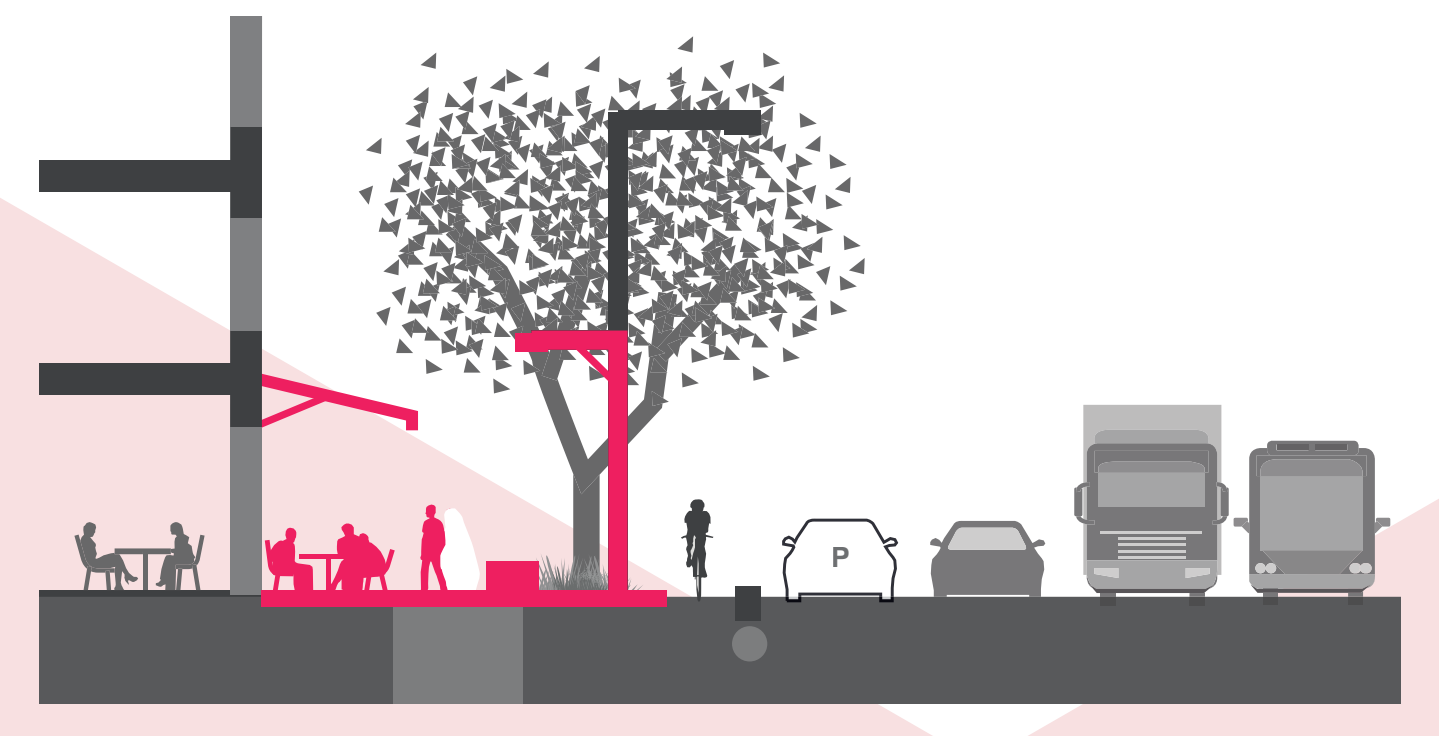
Figure 27: Road section produced as part of the development of the City Road Master Plan. The pedestrian experience on City Road could be enhanced by providing a high level of accessibility, supporting on-street activities and requiring wider footpaths.

• Ensure master plans and precinct plans deliver an enhanced pedestrian network consistent with the principles of the Walking Plan.