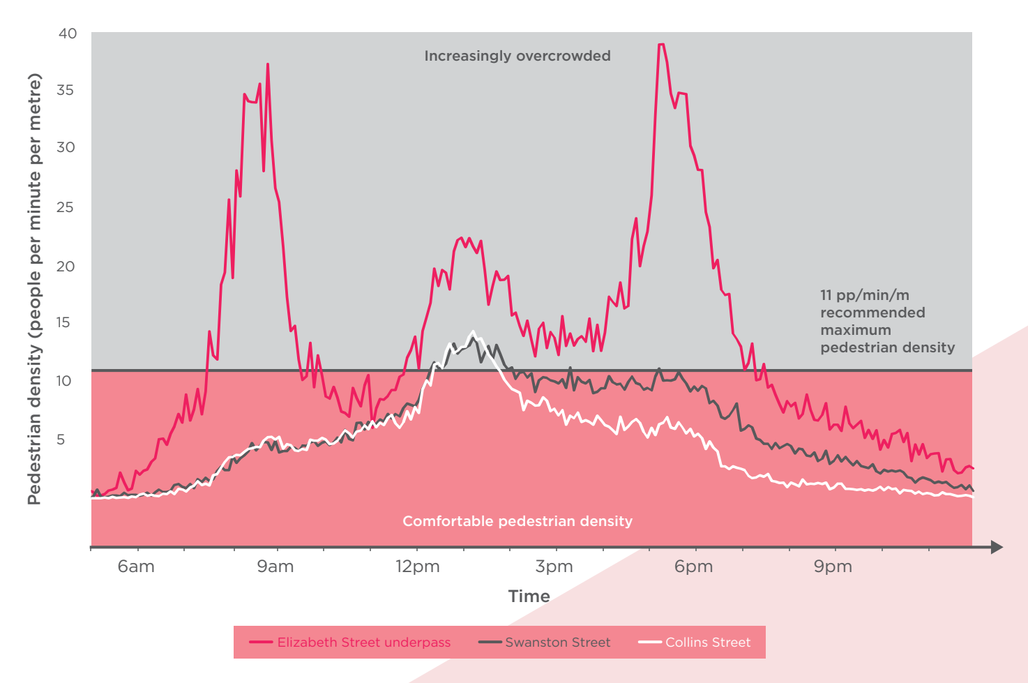
Figure 26: Counted pedestrian volumes on central city footpaths on an average Tuesday, September 2012