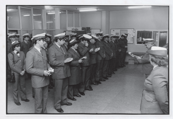
Morning roster session, 1985