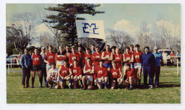
Melbourne City Council Parking Officers Football Team, late 1980s