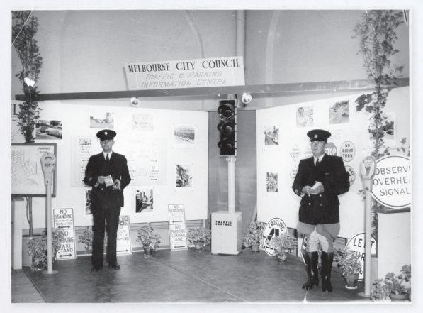
Parking Officers manning Council information display at Royal Melbourne Show, 1958