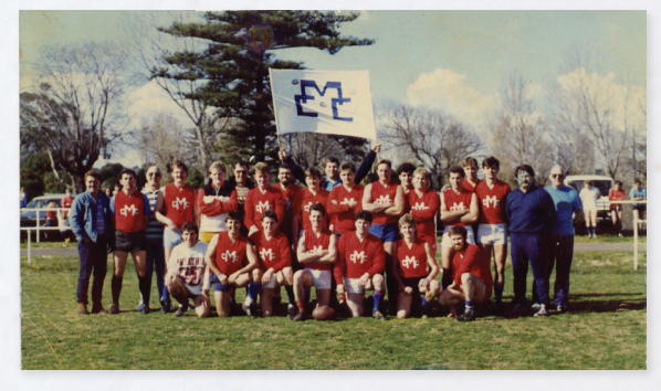
Melbourne City Council Parking Officers Football Team, late 1980s