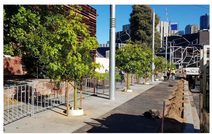
Works to cycle lanes, roadways, and street tree planting will be undertaken this week.

To find out more, please contact 9658 9658 , email southbankboulevard@melbourne.vic.gov.au , or visit melbourne.vic.gov.au/southbankboulevard