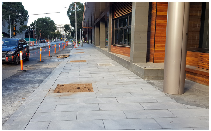
Bluestone footpaths along Southbank Boulevard and Sturt Street are being progressively completed and opened.