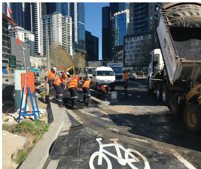
Bike path construction in progress

Stone installation also continues in the open space in front of the Melbourne Recital Centre and Southbank Theatre between Dodds Street and Sturt Street.