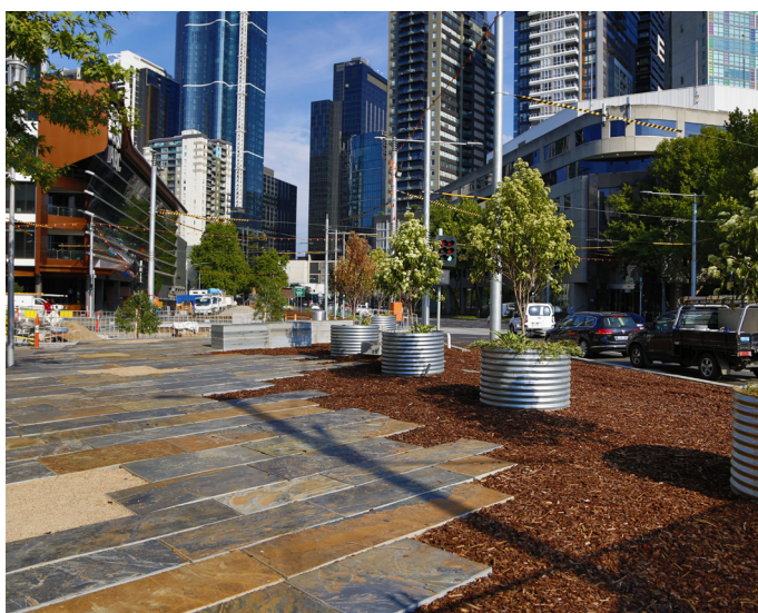
Stone installation nearing completion in front of the Melbourne Recital Centre and Southbank Theatre (note: temporary planters shown)

Construction activity for the Transforming Southbank Boulevard project has recommenced. With the roadway works complete, construction is focussed on the open space areas to be created along Southbank Boulevard between Dodds Street and City Road.