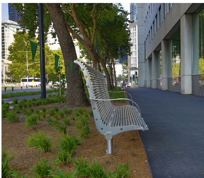
New seating, widened footpath and landscaping along Southbank Boulevard