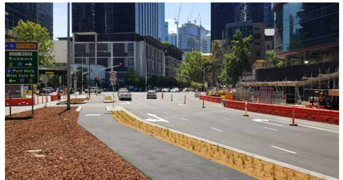
The roadway is now open between Kavanagh Street and City Road

We would like to thank all nearby businesses and residents for your support and patience in 2019 during construction of this important project for Southbank.