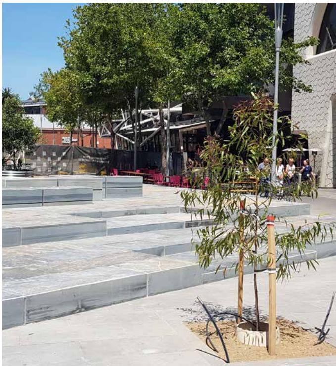
Construction is progressing on the landscape area to the front of the Melbourne Recital Centre and Southbank Theatre

The last day of construction for 2019 will be Friday 20 December. Work will recommence in the middle of January 2020. The site will be properly secured during the closure.