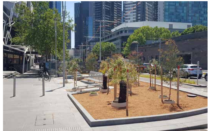
The landscape area at the intersection of Dodds Street is now open to the public