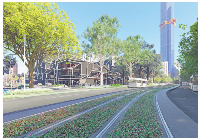
Artist's impression of completed landscape between St Kilda Road and Sturt Street

We apologise for the inconvenience and thank you for your patience. To find out more, please contact 9658 9658 or visit melbourne.vic.gov.au/cityprojects