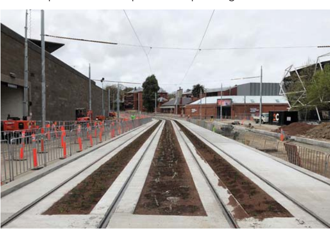
Our first green planted tram track in the City of Melbourne