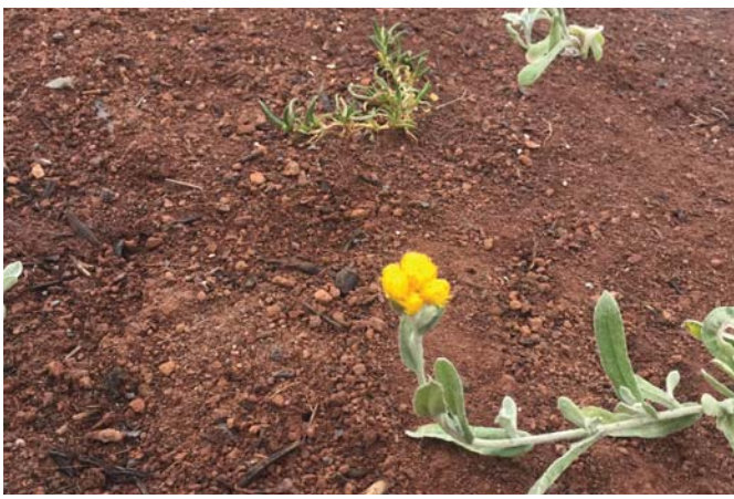
Flowers are coming into bloom in the planted track