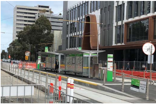
Tram Stop 17 is now complete and operating on Sturt Street

Over the course of the coming months, vehicle access to the section of Southbank Boulevard between St Kilda Road and Sturt Street will reopen as construction works in this work area are completed.