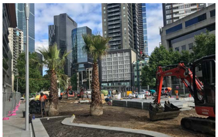
Mature palm trees planted as works continue

To find out more, please contact 9658 9658 email southbankboulevard@melbourne.vic.gov.au or visit melbourne.vic.gov.au/cityprojects