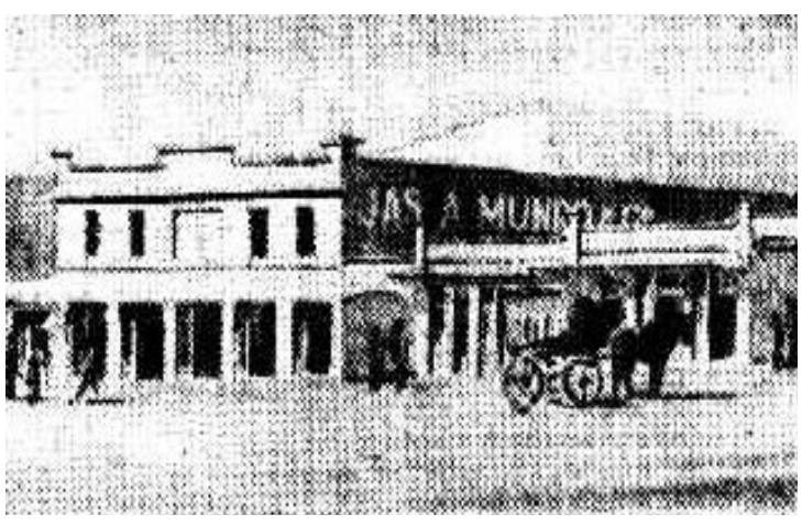
View of the Therry Street shops in 1913.

If the archaeologists find artefacts of significance, such as individual objects or evidence of previous buildings, they will document their discoveries. The investigation are expected to be complete by April and a report will be provided if anything is revealed.