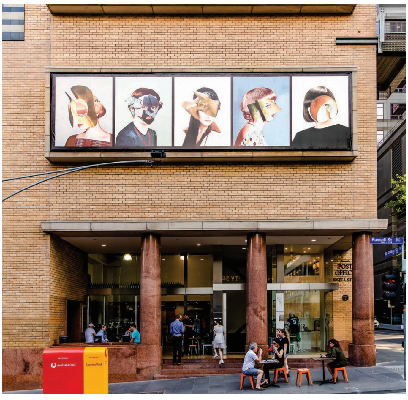
Image 2: Aylsa McHugh, Persona, 2020. Hero Apartment Building.

Melbourne's creative industries have been jobs powerhouses, contributing $31 billion to the economy annually and employing 260,000 people or 8 per cent of the state's workforce. This in turn has helped Melbourne develop and support a vibrant city with over 1600 cafés and bars in the municipality where people want to live and socialise.