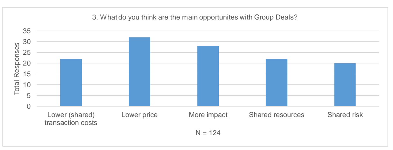
FIGURE 2: INSIGHTS ON THE OPPORTUNITIES WITH GROUP DEALS

At a BRC-A webinar the City delivered on the topic of Group PPAs in August 2020°, attendees were polled to understand the opportunities they see in group deals. The results reveal that PPA players see a broad range of benefits and opportunities: