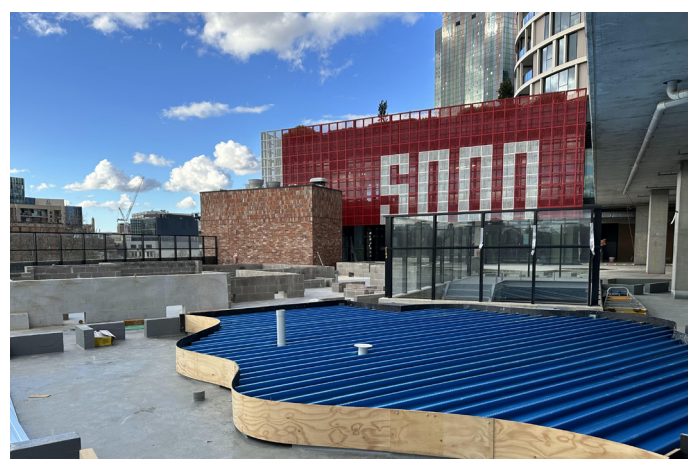
Landscaping and waterproofing works on the rooftop terrace