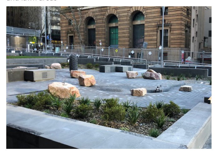
Open space water feature