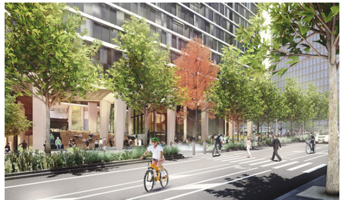
Artist impression of new park on Market Street

In September this year, Council endorsed a proposal to make the new Market Street Park a smoke-free area. New bins with 'no smoking' signage will be installed by the end of the year to remind users that smoking is prohibited in the open space.