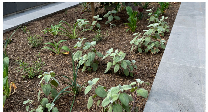
Southern park extension nearing completion