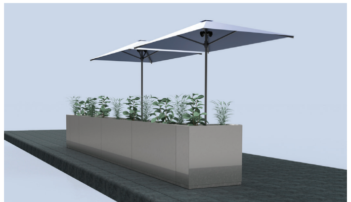
A render of the café screen planter boxes

Nearby residents and traders will be notified of disruptions ahead of works commencing.