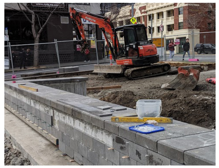
New retaining wall construction at Lincoln Square South

Works are underway to transform Lincoln Square. Works completed to date have included converting roadway and car parking into open space, allowing for the installation of new kerb creating space for trees, footpaths and other park infrastructure such as footings for light poles and retaining walls.