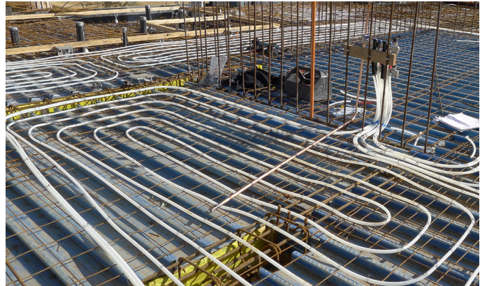
August 2019 - Hydronic pipe installation