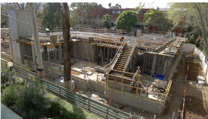
September 2019 - Installation lift shaft and first floor slab structure