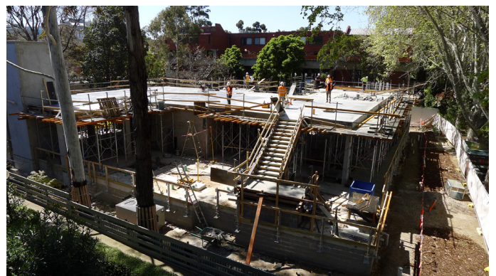
September 2019 - First floor slab completed

To find out more, please contact 9658 9658 or visit melbourne.vic.gov.au/cityprojects