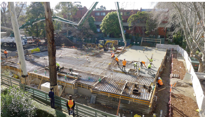
August 2019 - Ground floor slab pour