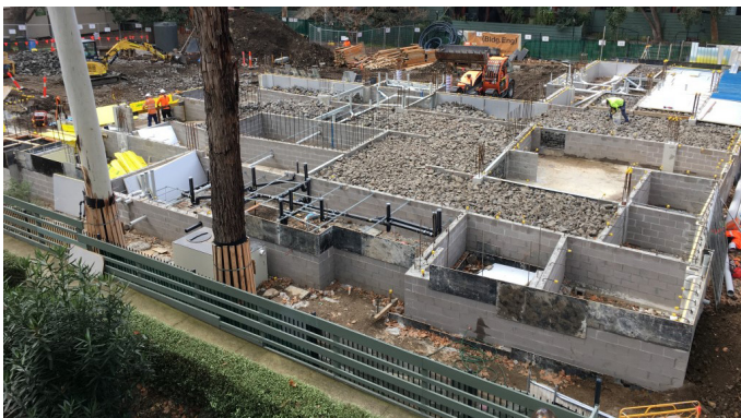
July 2019 - Completion of sub-floor rock labyrinth