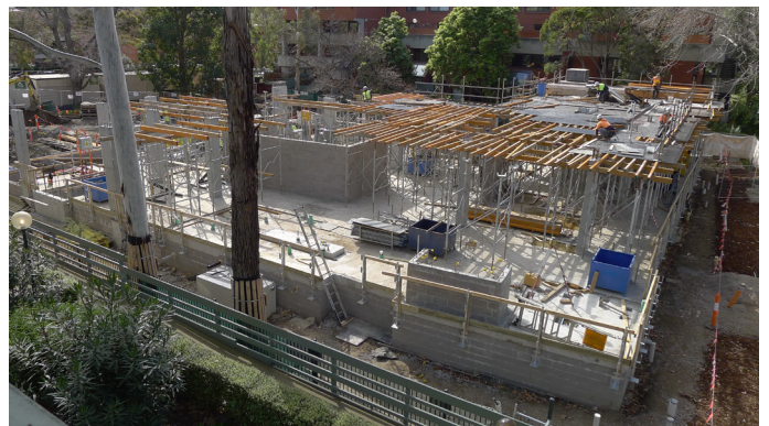
August 2019 - Commencement of the first floor slab structure