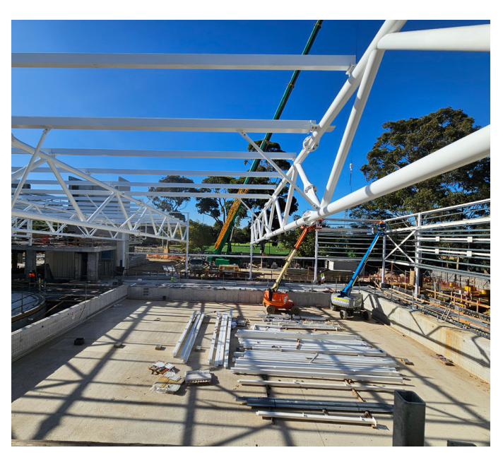
The pool area

The remainder of the roof will be installed in the coming months and is expected to be complete by mid-2024.