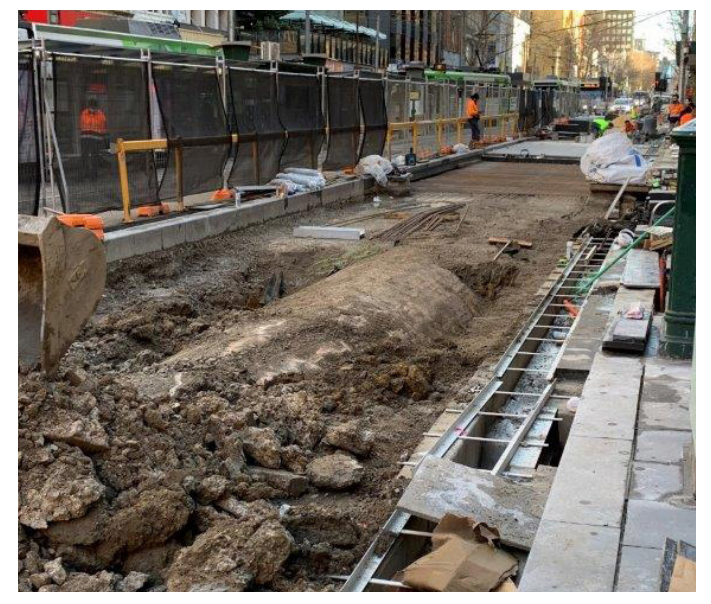
Drainage works beneath the roadway