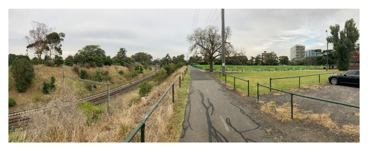
Photo 2 Upfield rail line in a deep cutting before near Poplar Oval, looking northeast

The Upfield railway line runs through Royal Park, servicing the Royal Park train station. The line is in a deep cutting before meeting Park Street to the north at grade.