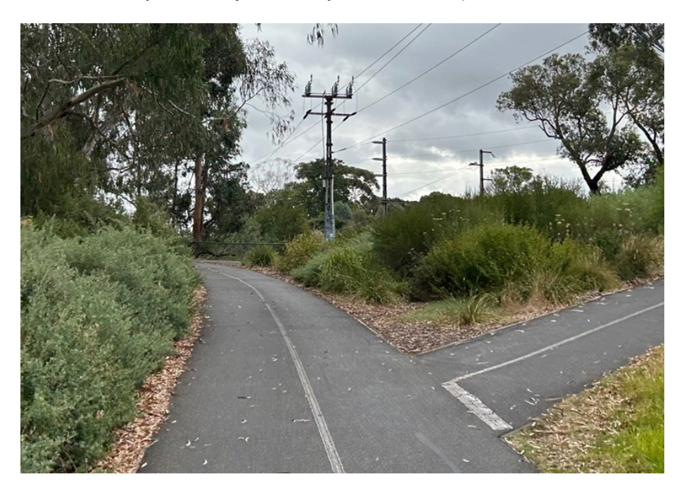
Photo 3 Capital City Trail junction with the Upfield Shared path, looking towards the railway

The Upfield shared use path, a path for cyclists and pedestrians that follows the Upfield rail line through the inner northern suburbs, crosses Park Street and enters Royal Park from the north. The southern end of the Upfield path connects to the Capital City Trail to the south of the Royal Park Tennis Club. Cyclists can join the Royal Parade bike path and on-road bike lane at Park Street.