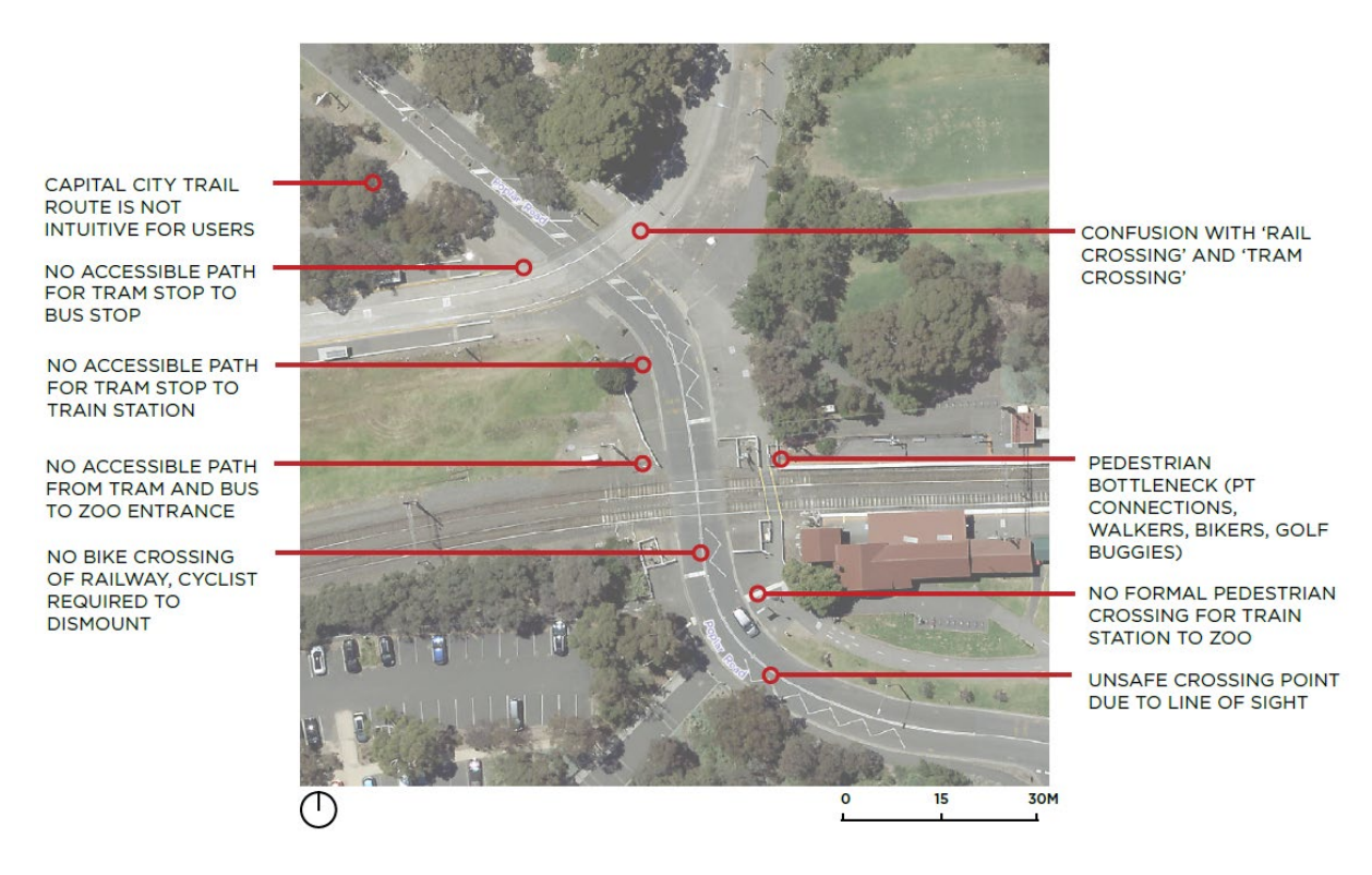
Figure 2 Royal Park Station precinct issues identification.

The closure of the railway line for a significant period for the project construction provides an opportunity to fix these issues. Investment through the project is warranted to offset the impact of the closure on public transport access to Melbourne Zoo and this area of Royal Park (as detailed in section 3.3).