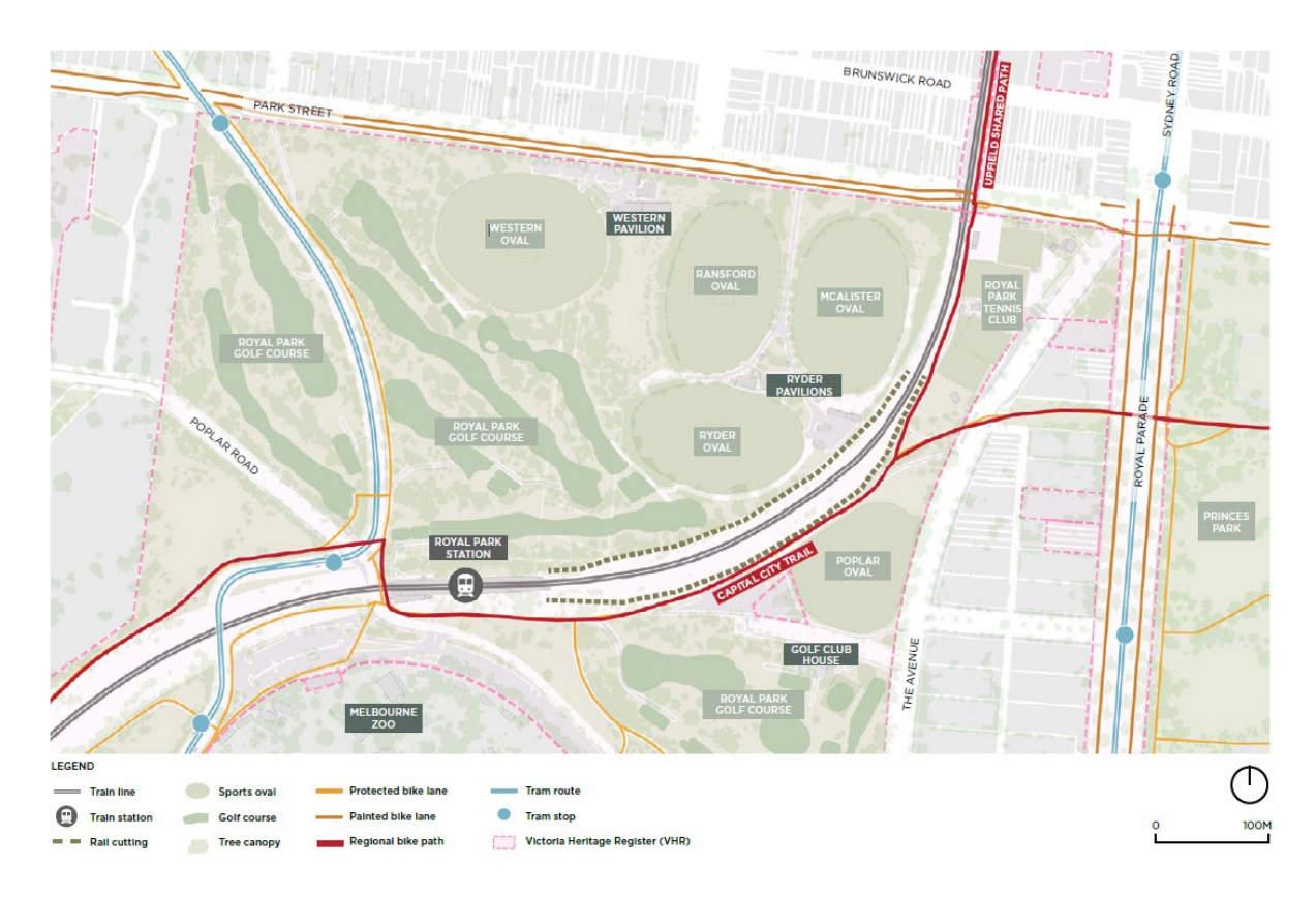
Figure 1 LXRP site context within City of Melbourne