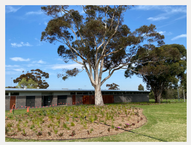
The sugar gum and red gum trees at the back of Brens Pavilion

The sugar gum and red gum trees located at the back of Brens Pavilion were planted by the Acclimatisation Society of Victoria between 1860-90 as part of a pathway from The Avenue to the entrance of Melbourne Zoo.