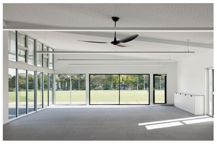
The social room in the new pavilion