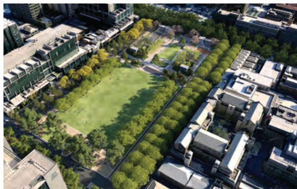
University Square - Overall Master Plan visualisation

New street trees will be planted as part of this stage of work. Sapporo Autumn Gold Elms ( Ulmus 'Sapporo Autumn Gold' ) will be planted on both sides of the new Leicester Street.