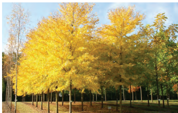
Leicester Street - New street trees, Ulmus 'Sapporo Autumn Gold'