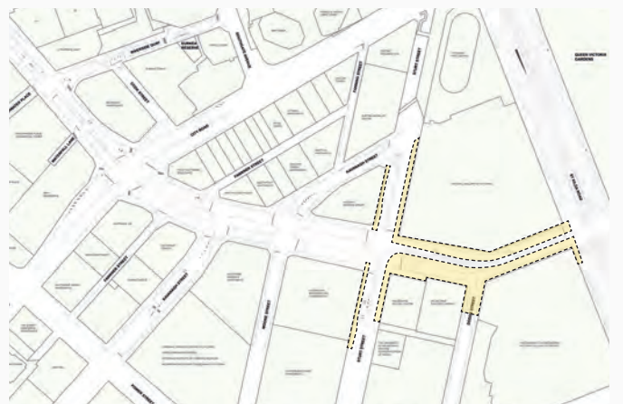
Stage 1 A - Early works construction zone between St Kilda Road and Sturt Street.

Pedestrians will continue to have access to the precinct.