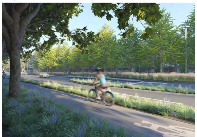
Artists impression of the new separated cycle lanes