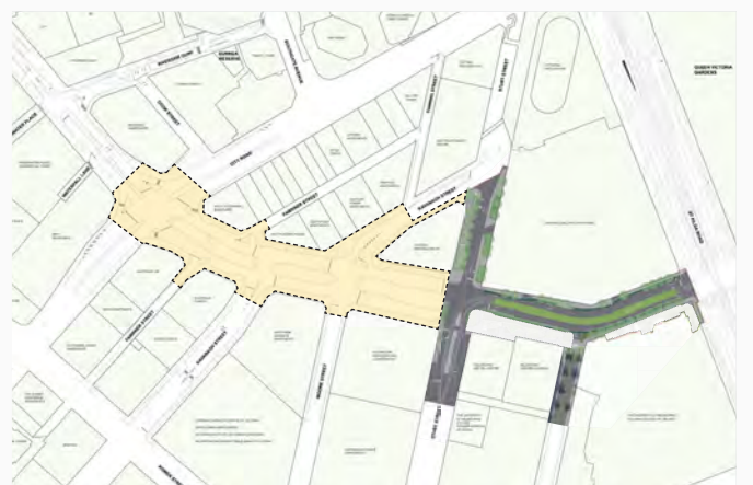
Stage 1 C - Construction zone for civil works between Sturt Street and City Road.

Southbank Boulevard will progressively be re-opened.