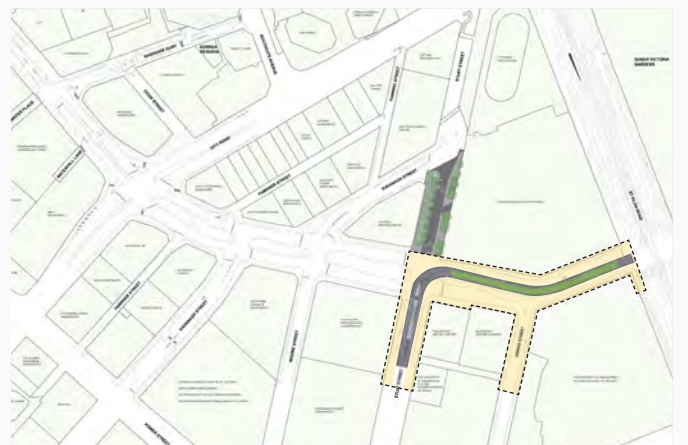
Stage 1 B - Construction zone for tram infrastructure extending from St Kilda Road south along Sturt Street.

Pedestrians will continue to have access to the precinct.