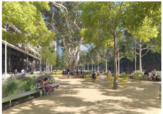
Artists impression of the public open space in front of the ABC.