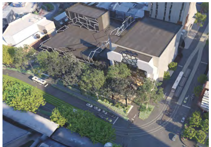
Artists impression of the new tram stop and Arts Gateway public open space.

Civil, road and landscape construction works between Sturt Street and City Road