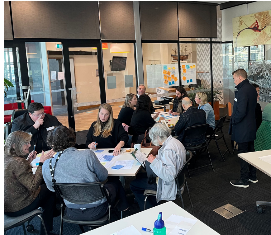
Pre-Summit Small Focus Group Discussions (Representative Groups)