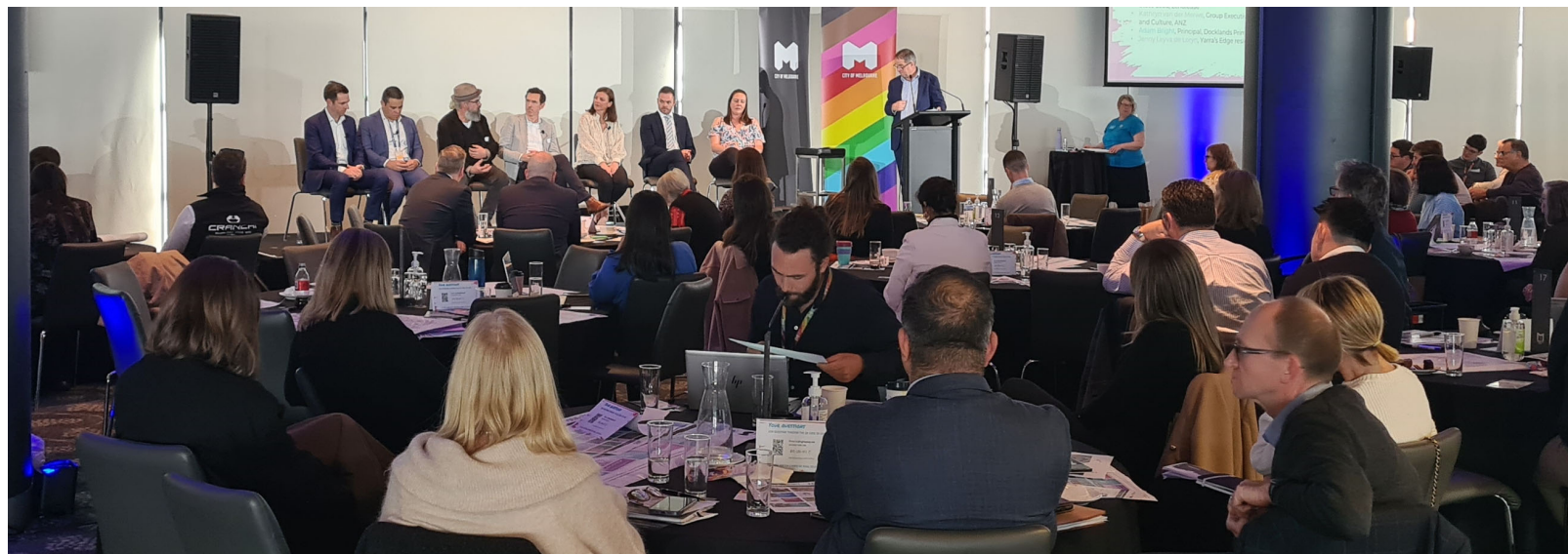
Photo from the Docklands Summit of the panel discussion