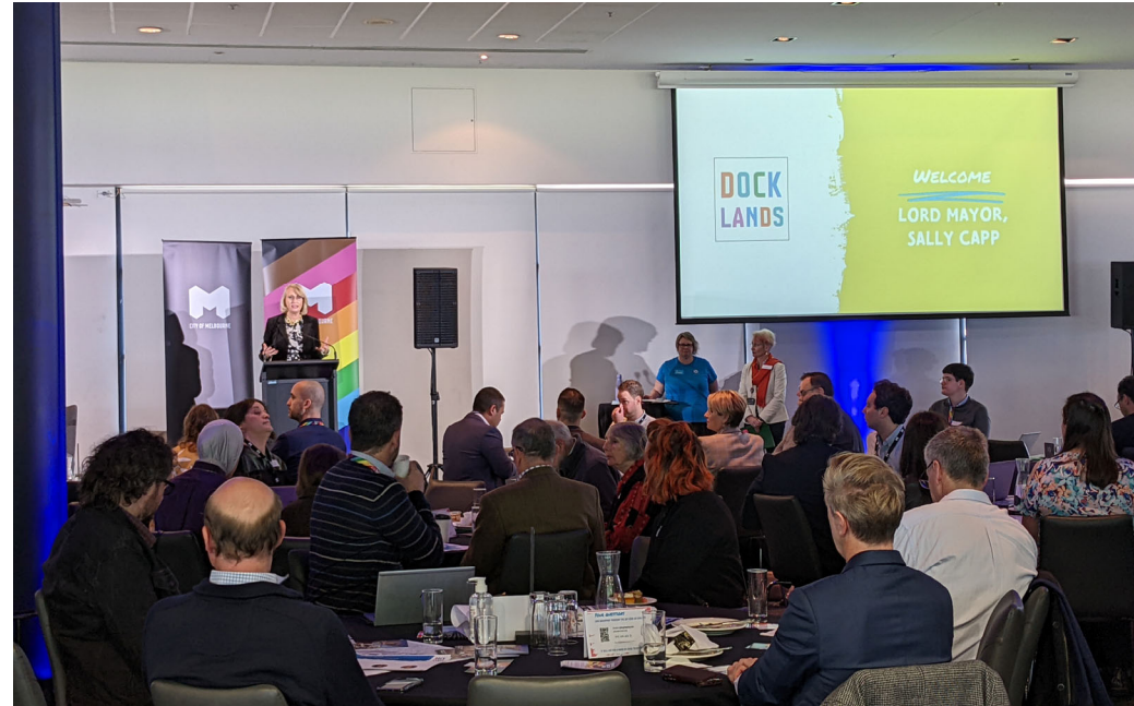
Photo from the Docklands Summit of the Lord Mayors welcome