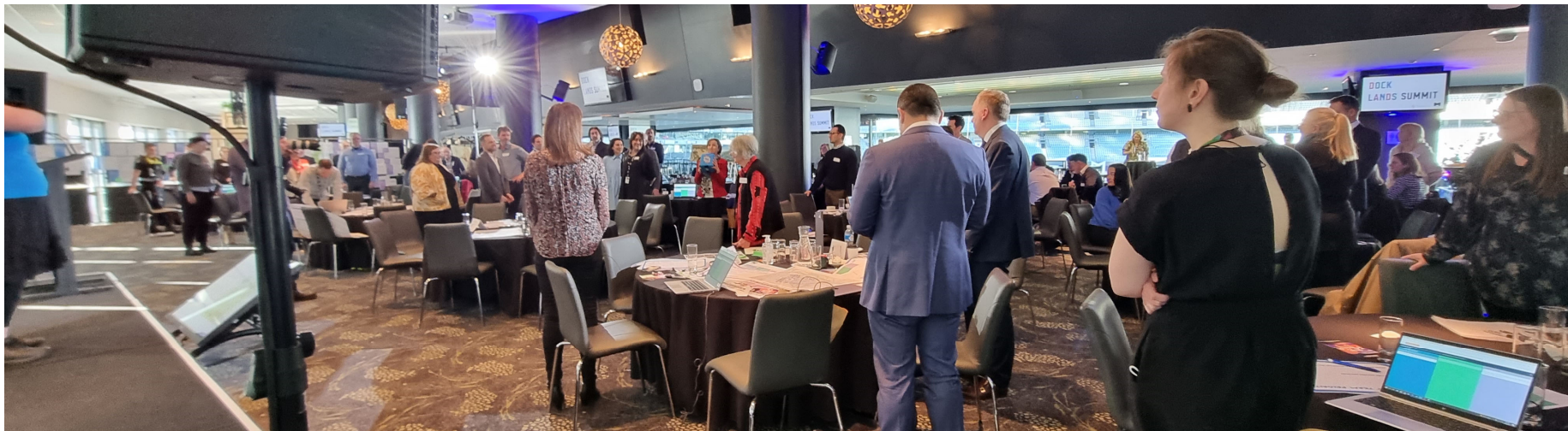
Photo from the Docklands Summit of attendees