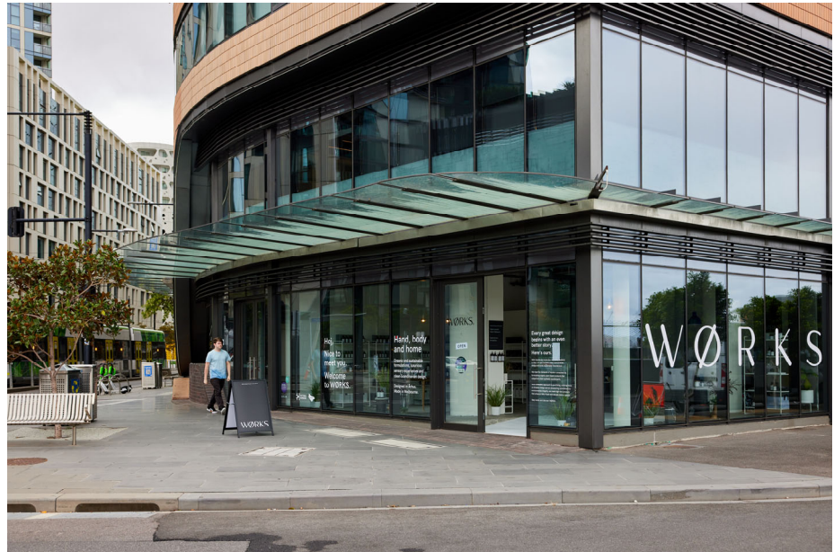
Activated Shopfront: Beauty product manufacturers WORKS located at 889 Collins Street