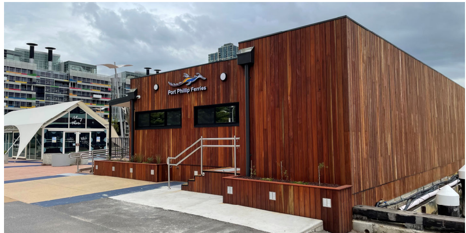
Port Phillip Ferries terminal located at Yanonung Quay