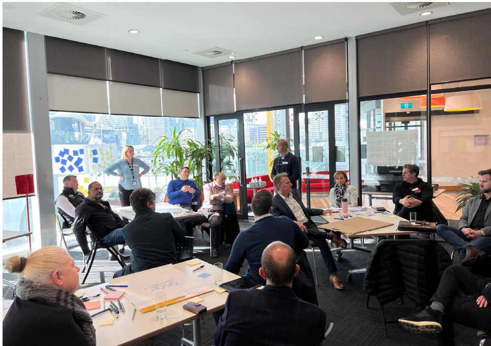
Photo from the pre-Summit Small Focus Group Discussions (Small Business)

(Docklands Chamber of Commerce, Docklands Representative Group, Melbourne Maritime Network, Renew Australia, Friends of Moonee Ponds Creek, Docklands Primary School, Docklands Owners Corporation Network)