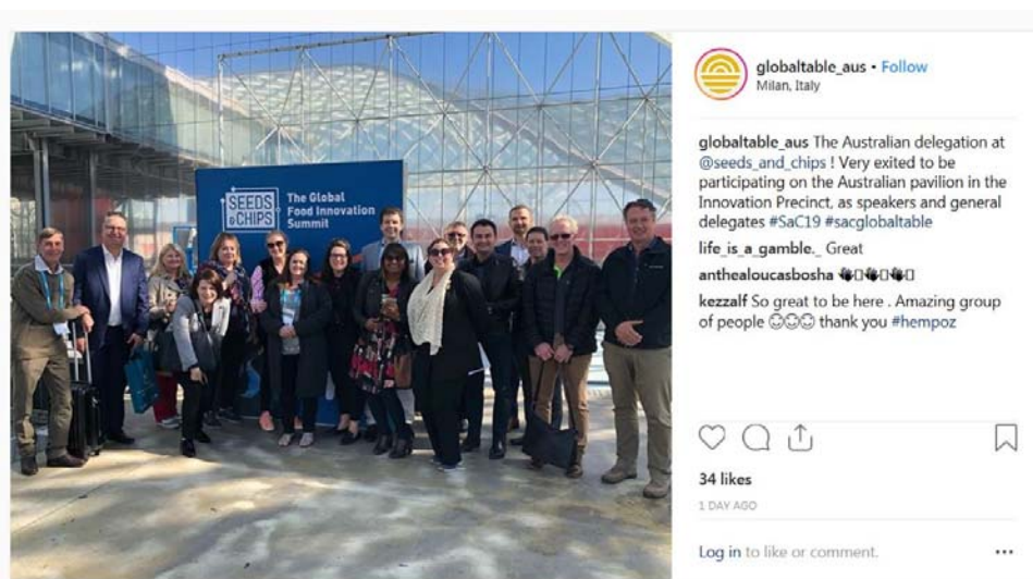
Left: Australian delegation members arrive at the Summit Monday 5 May 2019

During 4 days in Milan thousands of innovators came together from around the world to build a better food system for all. Innovation creates opportunities to explore trends, develop product, and discover new technology. It takes just one small spark for the next big idea to catch on.