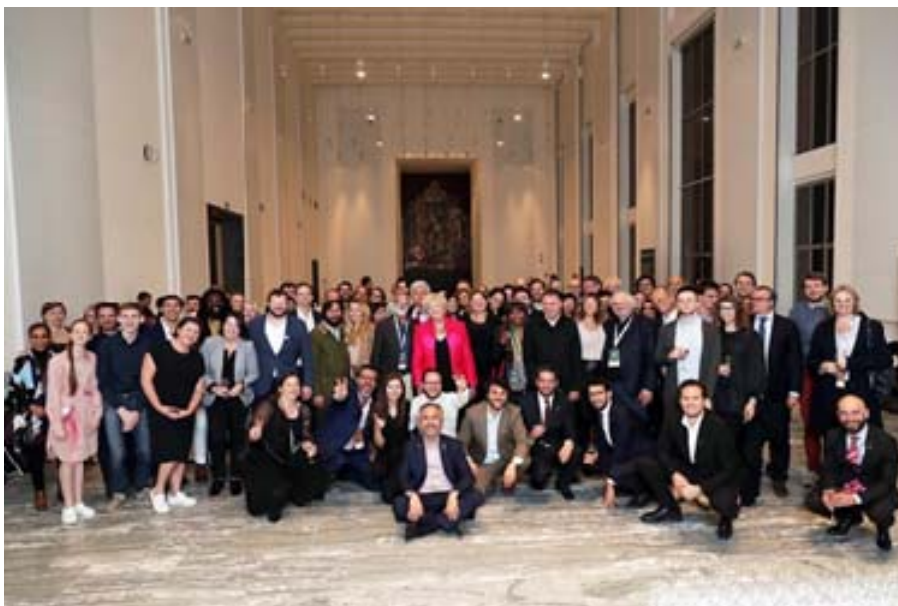
Above: Attendee group photo