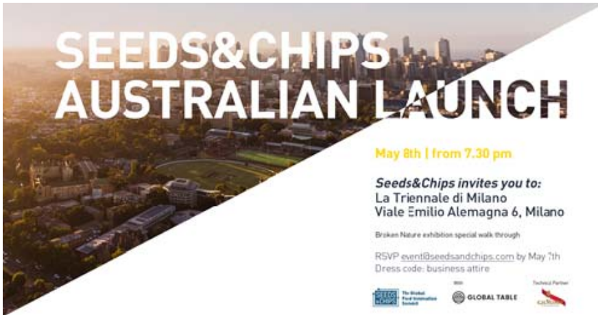
The Australian Launch of Global Table/Seeds&Chips September 2019