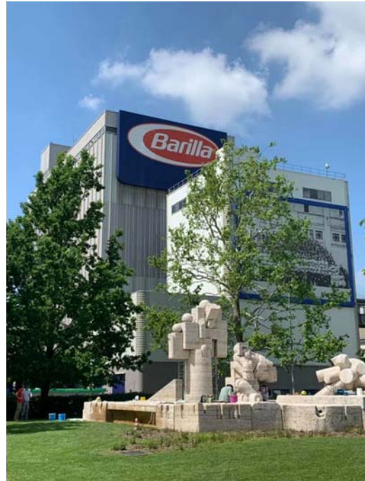
Above: the largest pasta factory in the world