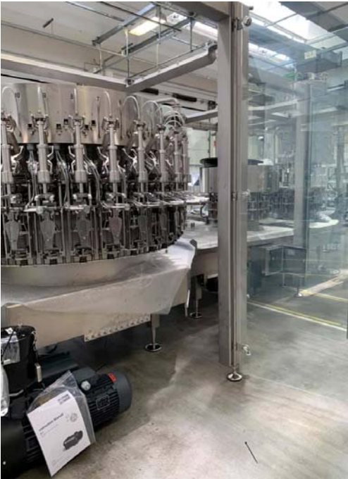
Above: Packaging machine at IMA