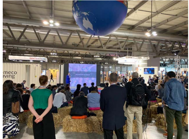
Above: Presentation to delegates