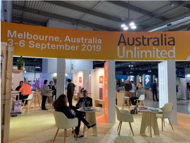
Above: The Australia stand

About the Australian stand :This is the first time Australia has had a stand at this event. The Australian stand was designed to promote and showcase Australian capability, and to invite international guests attending Seeds&Chips Milan to travel to Australia to attend Global Table, a new agribusiness and food innovation event taking place in September 2019 in Melbourne.