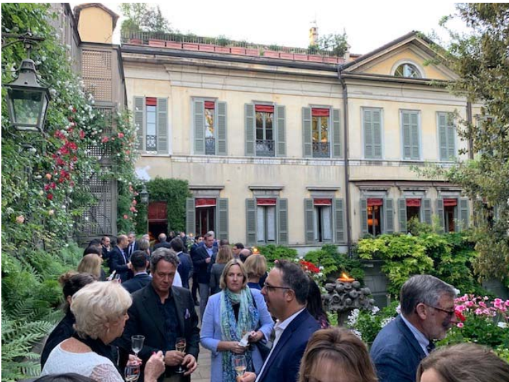
Above: Reception at the Plazzo Crespi

Seeds&Chips Reception: Later that night a VIP reception was held at Palazzo Crespi to celebrate the opening day of the event. The reception was an opportunity for networking with the Australian delegation and other VIPs attending the Summit including Heather Mills and Kerry Kennedy .