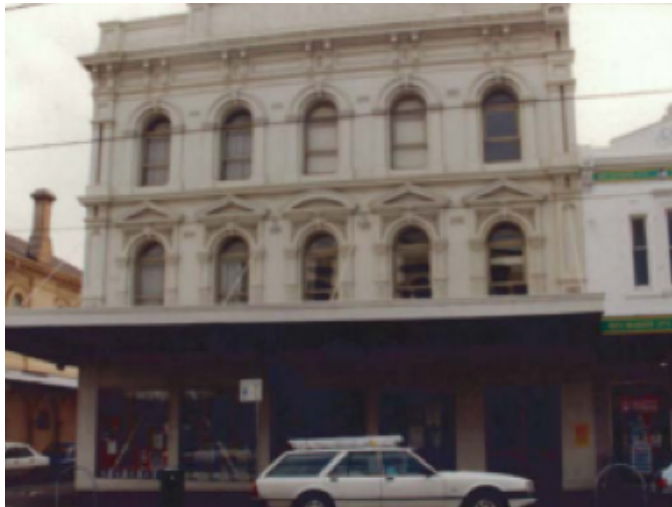
Building Identification Sheet 1985

The following is the building when graded C in the 1985 Urban Conservation Study. No signage is visible.