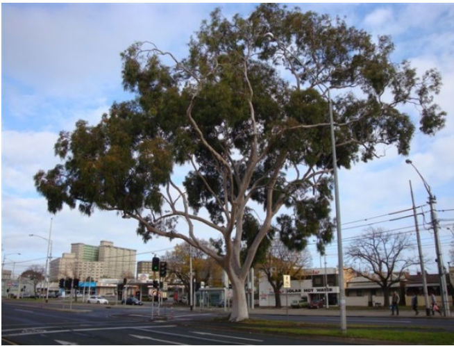
Fig. 1: National Trust-listed lemon scented gum at the Flemington Road / Church Street corner. ( http://vhd.heritage.vic.gov.au/search/natrust_result_detail/71367 )