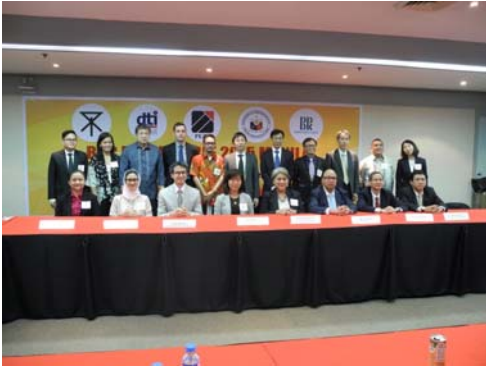
2015 BPC Network Roundtable participants