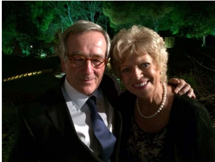
[Deputy Lord Mayor with Mayor of Barcelona, Xavier Trias]