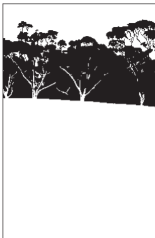
Tree form and silhouette