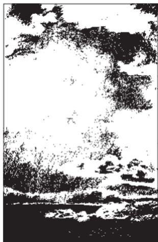
Sky and wind