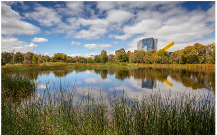
This shows a reflection of sky and wind in the newer landscape character of water.