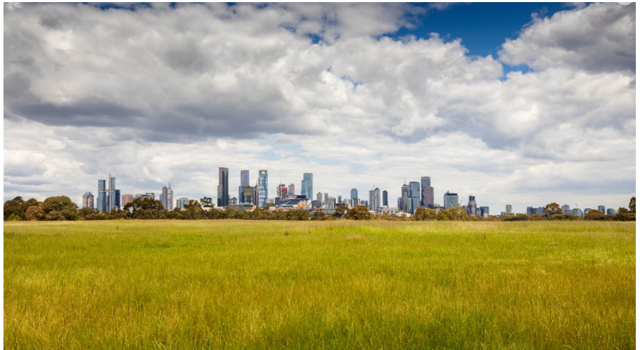
This landscape and view of the city is only possible due to the generosity of size and scale of Royal Park, the absence of buildings and infrastructure, and the careful siting of tree planting.