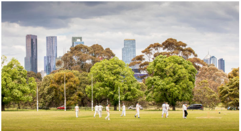
This image shows the frame of tree species around ovals, with taller species behind, creating a unique and recognizable tree form silhouette that is used in signage for Royal Park.