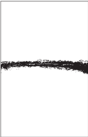
Landform and horizon