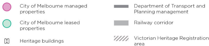
Figure 2. Royal Park management areas