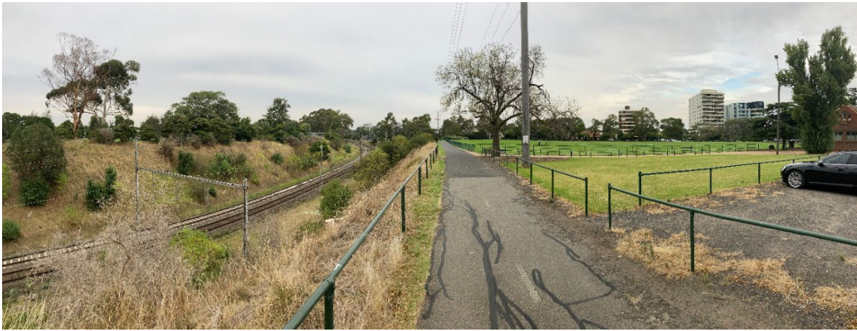
Photo 2 Upfield rail line in a deep cutting before near Poplar Oval, looking northeast

The Upfield railway line runs through Royal Park, servicing the Royal Park train station. The line is in a deep cutting before meeting Park Street to the north at grade.