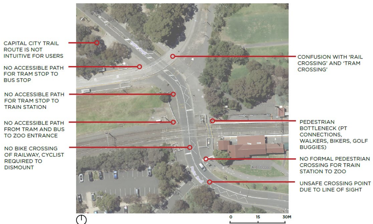
Figure 2 Royal Park Station precinct issues identification.

The closure of the railway line for a significant period for the project construction provides an opportunity to fix these issues. Investment through the project is warranted to offset the impact of the closure on public transport access to Melbourne Zoo and this area of Royal Park (as detailed in section 3.3).