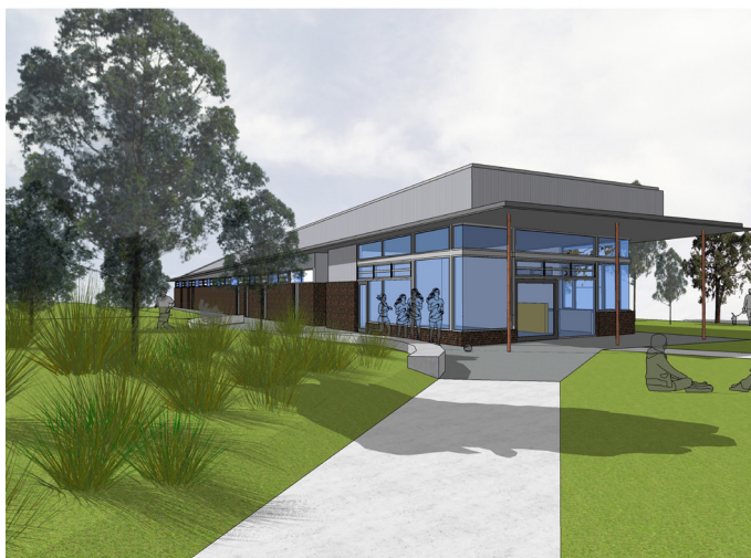
Artist impression - Western Pavilion

Following completion of the new pavilion, the existing pavilion will be demolished and the area returned to parkland.