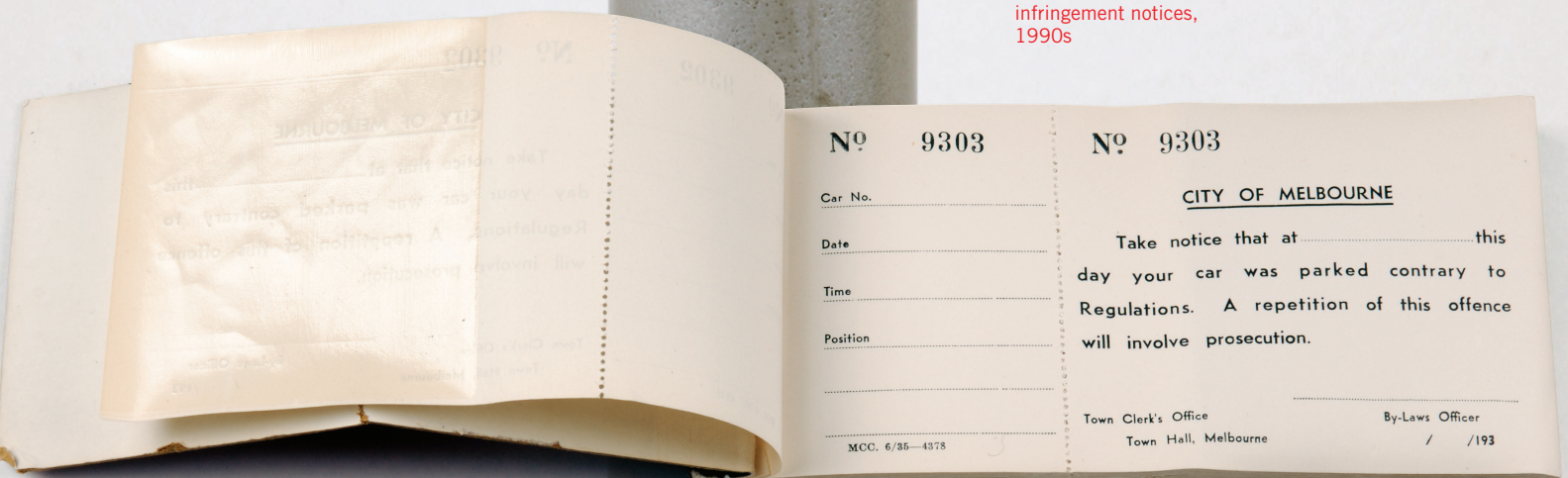
Early book of parking infringement notices, 1930s