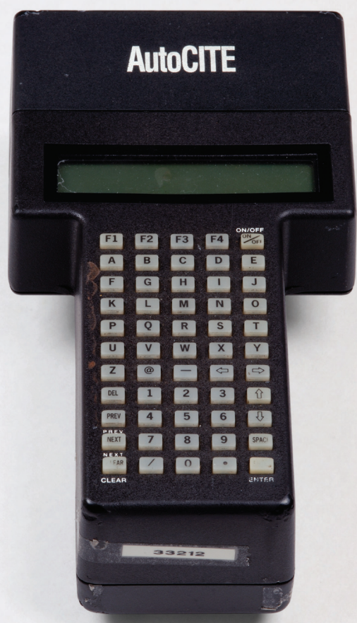
AutoCITE machine for issuing parking infringement notices, 1990s