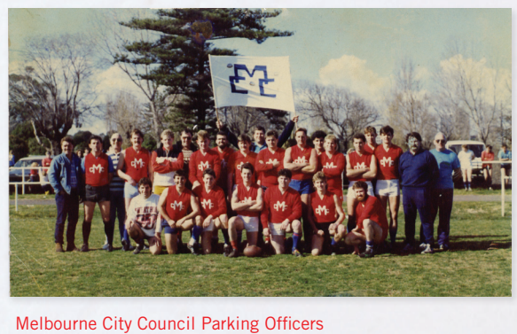
Melbourne City Council Parking Officers Football Team, late 1980s