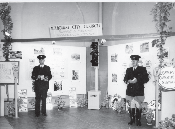
Parking Officers manning Council information display at Royal Melbourne Show, 1958