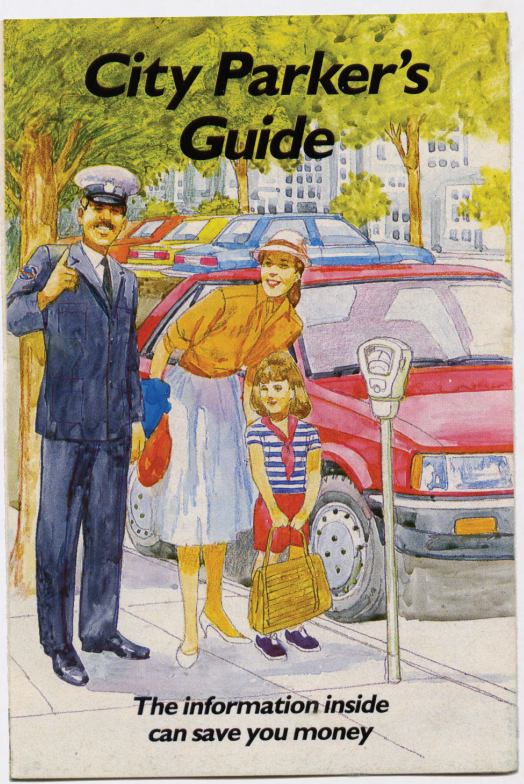
City Parker's Guide: Melbourne City Council brochure, early-1980s