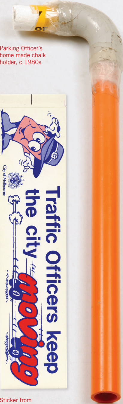
Parking Officer's home made chalk holder, c.1980s