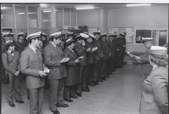
Morning roster session, 1985