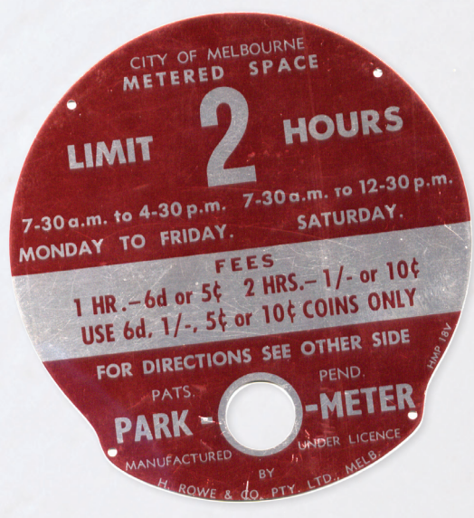
Parking Meter label plate, late-1960s