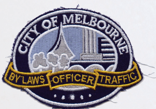
Parking Officers shoulder patch, early 1990s