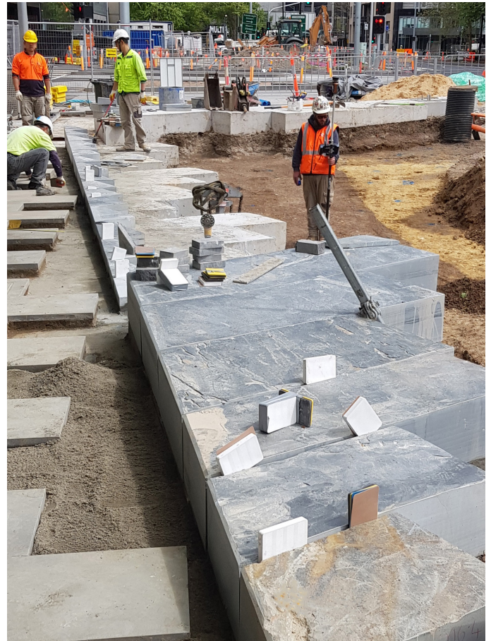
Stone installation between Dodds Street and Sturt Street

Construction of the open space area at the front of the Melbourne Recital Centre and Southbank Theatre is progressing. Concrete footings have been poured, and stone installation has commenced, along with tree and ground level planting.