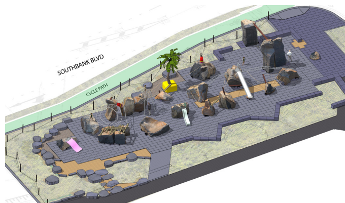
An aerial, digital impression of the play space (existing trees and new plantings have been removed from image for clarity)

COVID-19 has impacted several of the City of Melbourne's key projects in various ways. The safety of our community, people and contractors is always our highest priority, and we will keep you informed if things change and works schedules need to be adjusted.