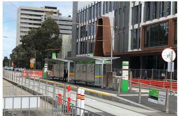
Tram Stop 17 is now complete and operating on Sturt Street

Sturt Street has now re-opened to traffic for north-south vehicle movement, allowing the Grant Street detour to again function for access to the Arts Centre Melbourne carpark.