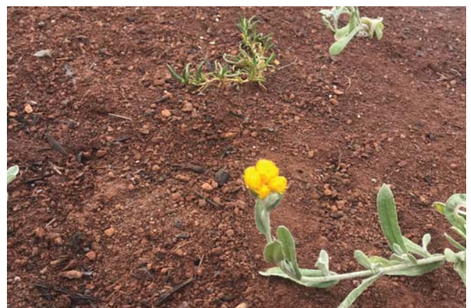
Flowers are coming into bloom in the planted track