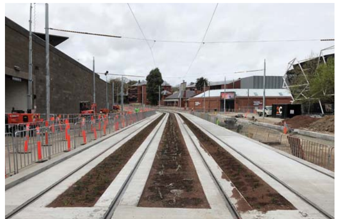
Our first green planted tram track in the City of Melbourne