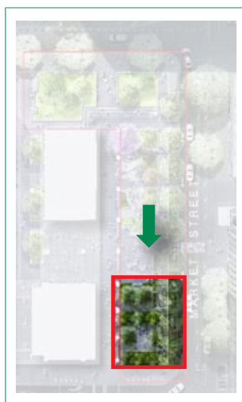
City Garden location on the corner of Market Street and Flinders Lane

During the community engagement process, you emphasised the importance of natural and indigenous planting design in providing visual interest, protection and screening from adjacent roadways with flexible furniture.