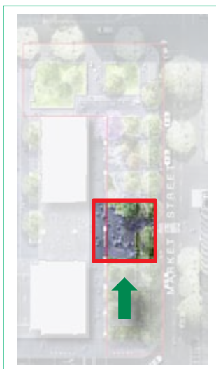
Location of central plaza on Market Street edge