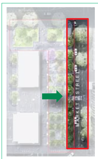
Full extent of Market Street between Collins Street and Flinders Lane