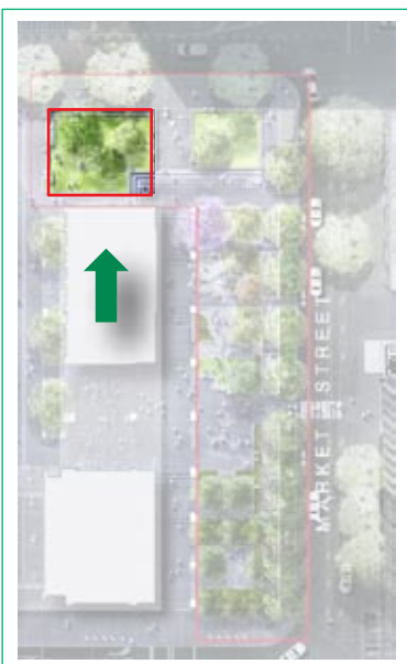
Northern lawn areas on Collins Street

During the community engagement process, the lawn area received largely positive feedback, however it was noted that the area lacked large trees for shade in summer and the lawn would need to be maintained to ensure it was usable all year round.