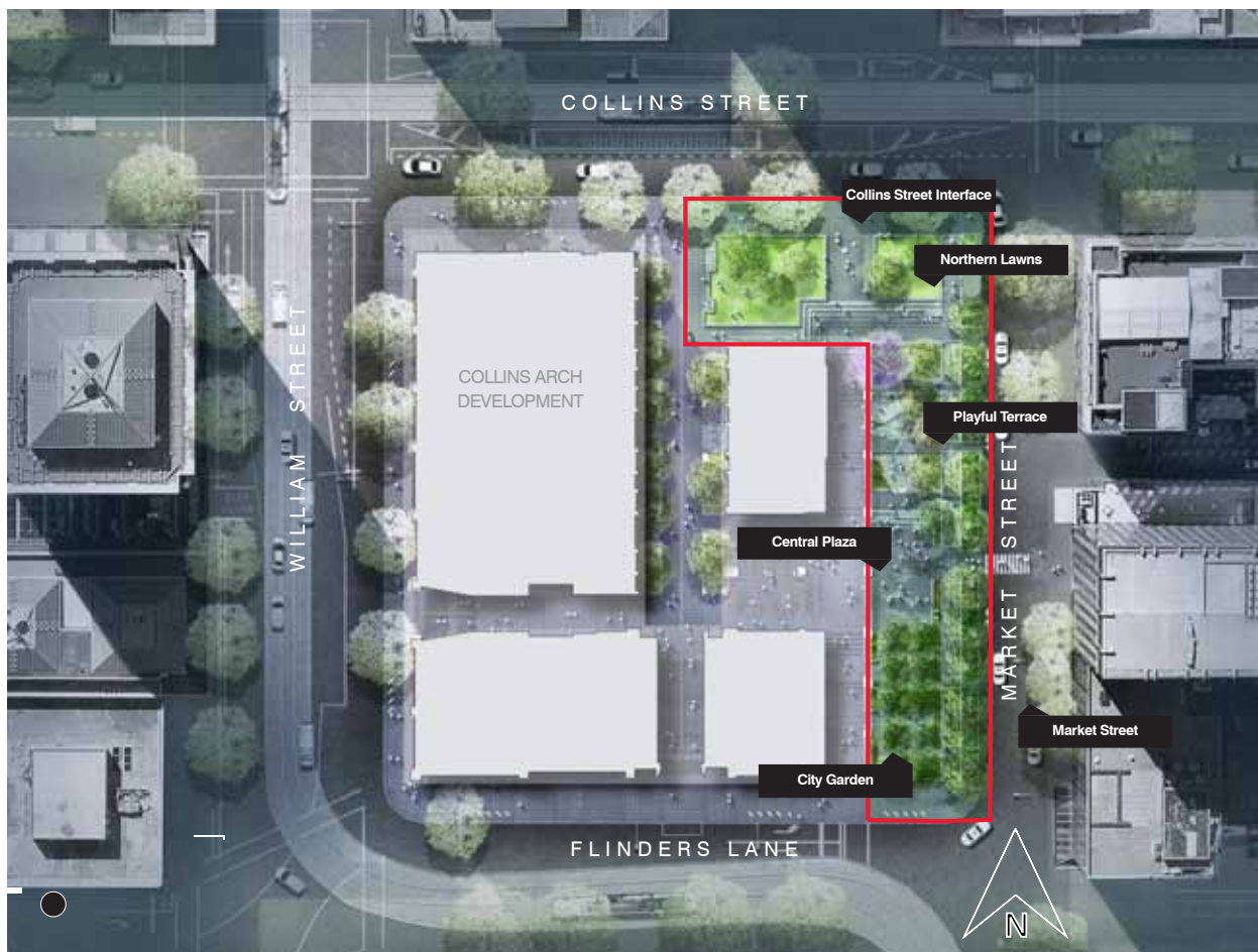
Aerial view of the final concept plan

These areas are described in greater detail on the following pages.