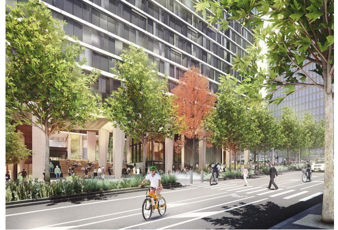
Artist impression of new park on Market Street

A road safety assessment has been completed for this project. Works to the traffic signals at the intersections of Collins and Market streets and Flinders Lane and Market Street have commenced and final activation will be completed by the end of the year.