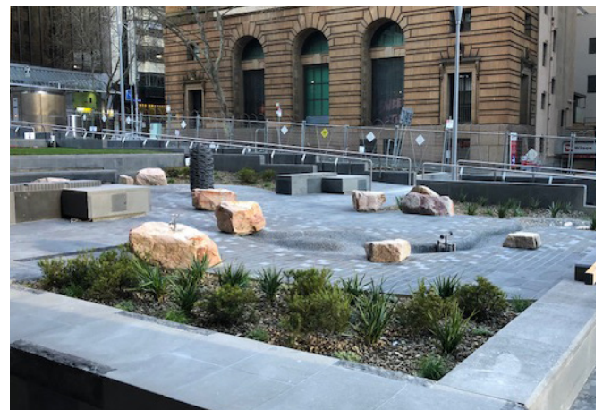
Open space water feature

To find out more, please contact 9658 9658 or visit melbourne.vic.gov.au/cityprojects