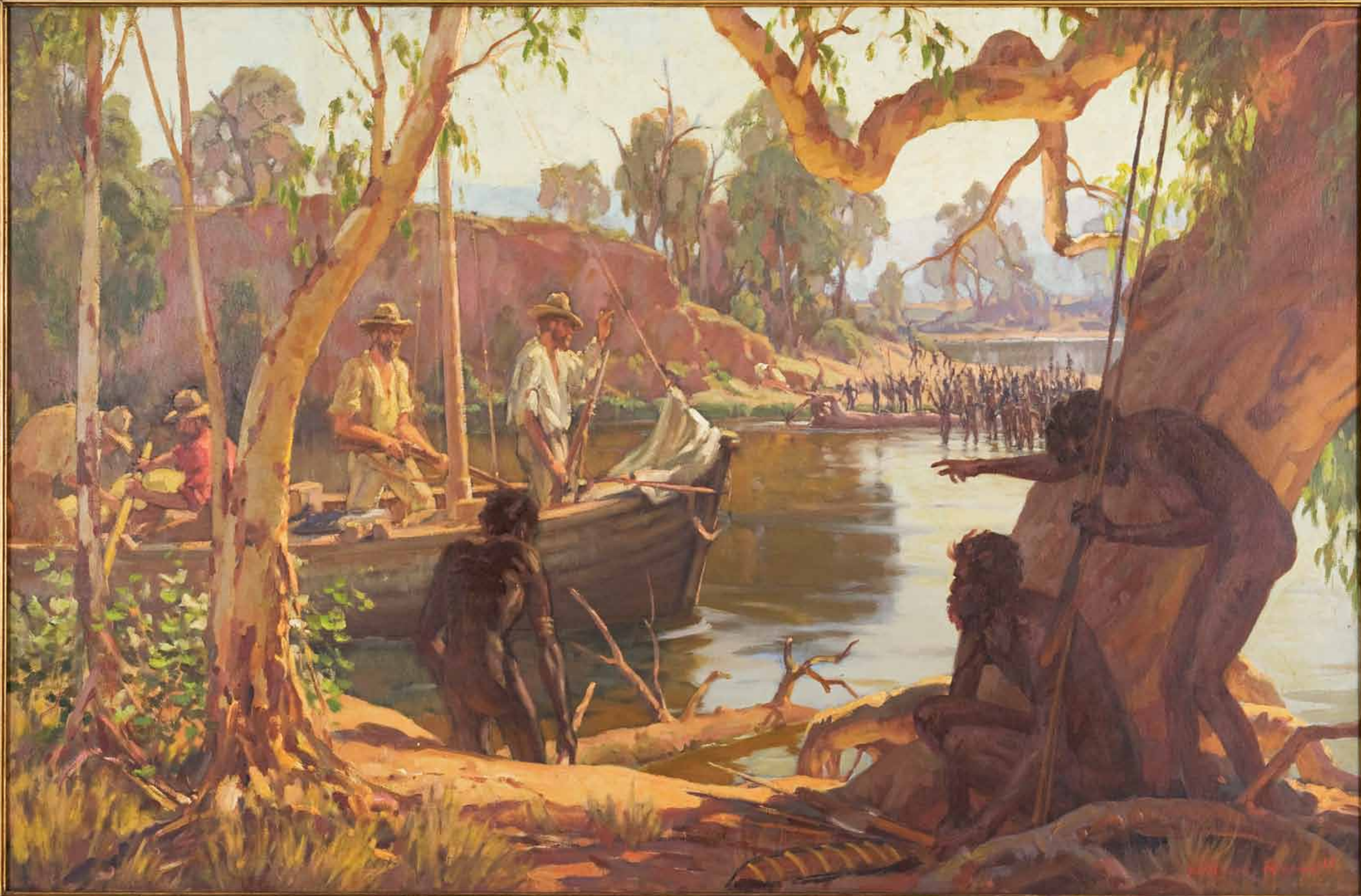
Portrait of a Native Australian