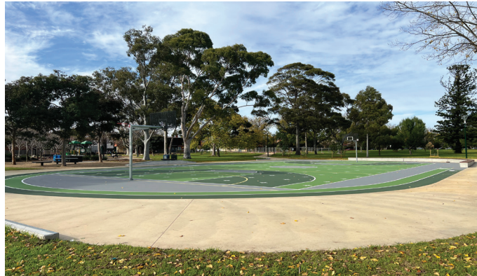
The relocated basketball court

To find out more, please contact 9658 9658 or visit melbourne.vic.gov.au/cityprojects