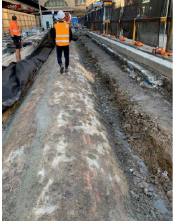
Exposed 120-year-old brick drain

Works to expand the footpath and upgrade signals will commence at the Elizabeth Street and Flinders Street intersection at the end of May.